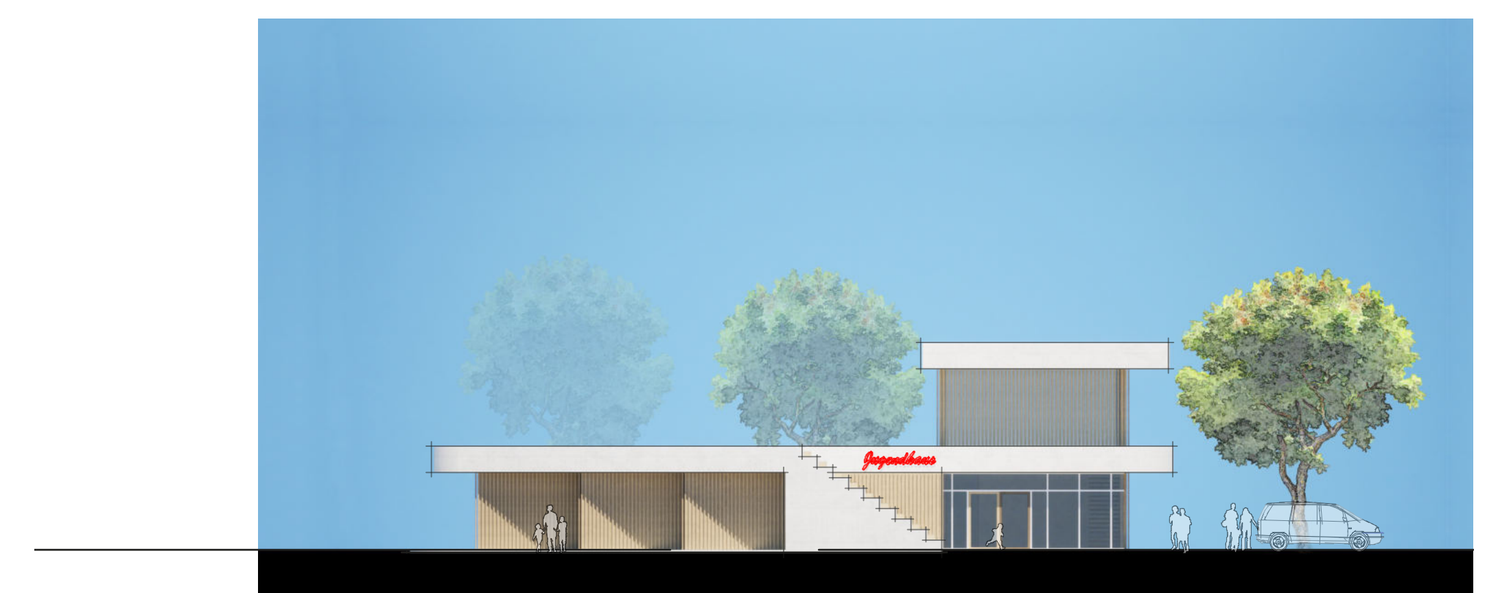
Südfassade M. 1:200