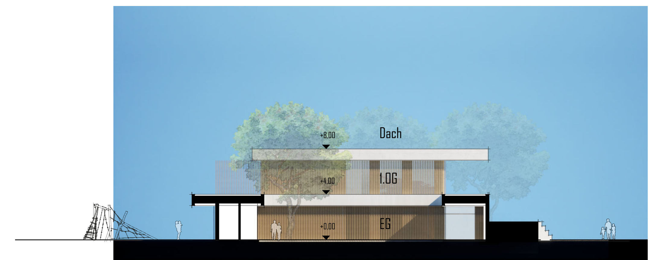
Schnitt A-A M. 1:200