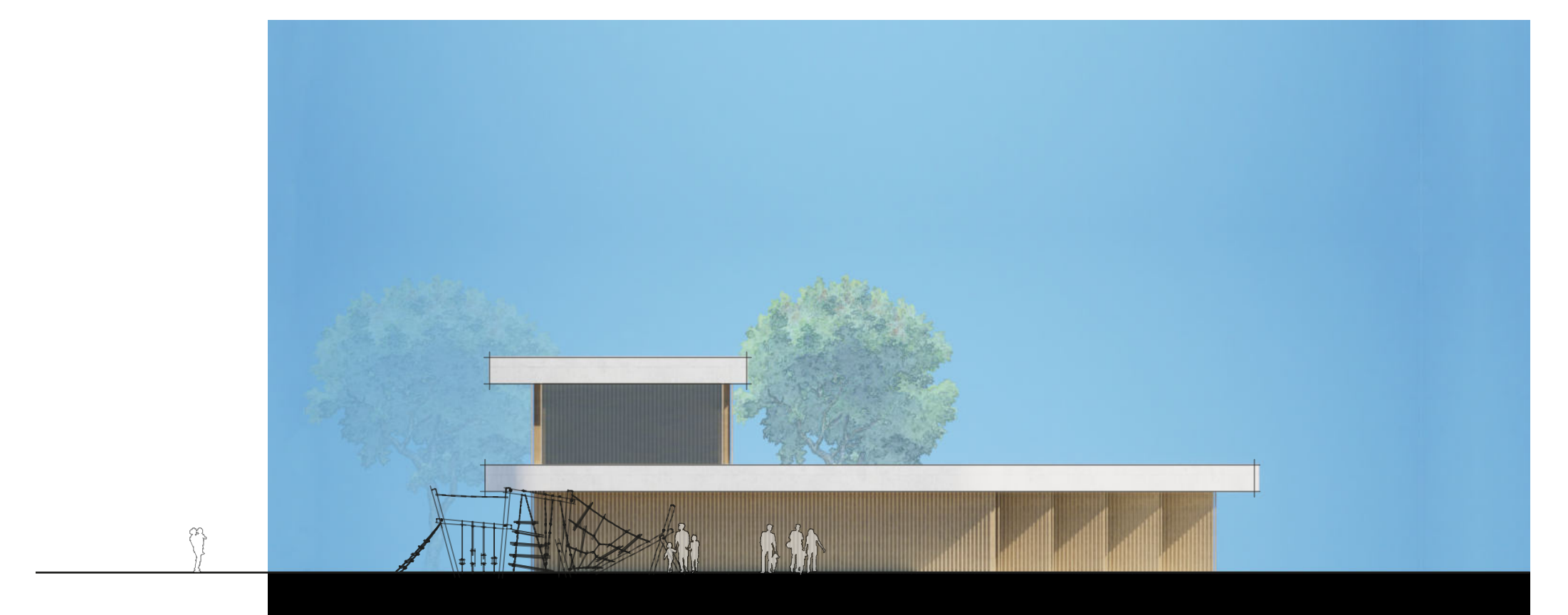
Nordfassade M. 1:200