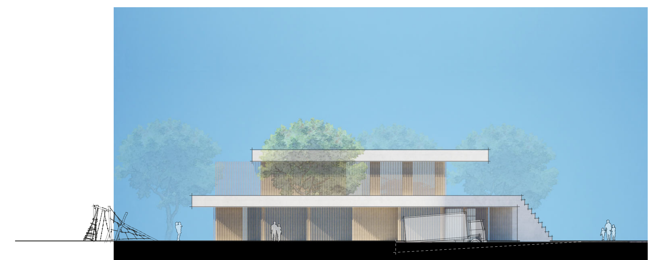
Westfassade M. 1:200