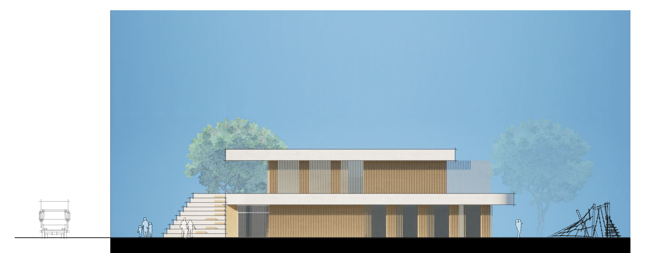
Ostfassade M. 1:200